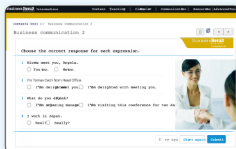
Business Result Second Edition Online Practice