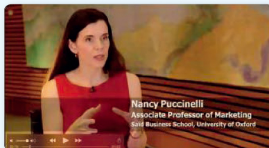
Video units from Said Business School, University of Oxford